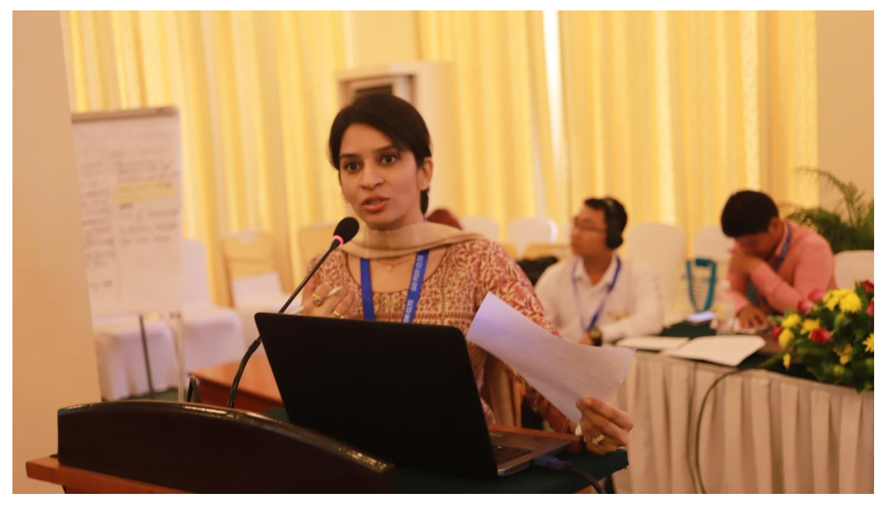
Figure 16 Dr Kadambari Balkawade, CEO, Zilla Parishad, Nagpur, India