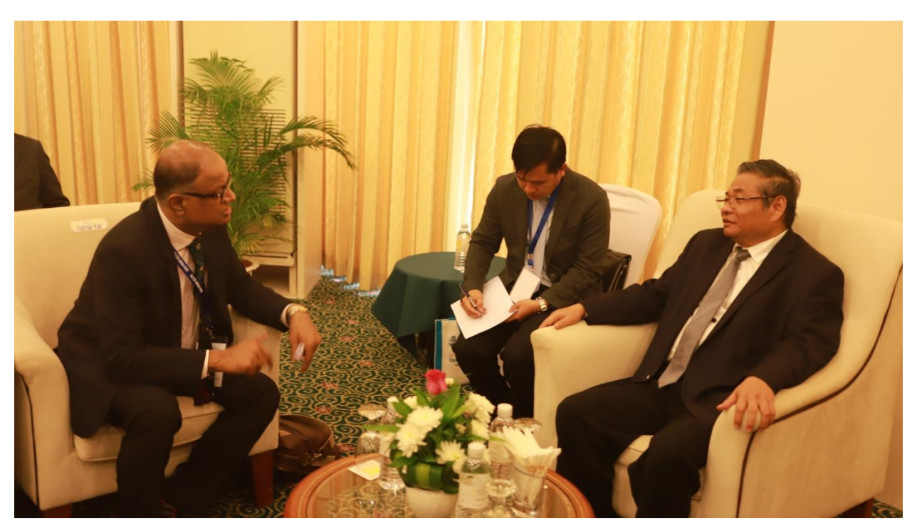
Figure 2 Dr. Kamal Kar interacting with Deputy Prime Minister of Cambodia, HE Yim Chhayy Ly