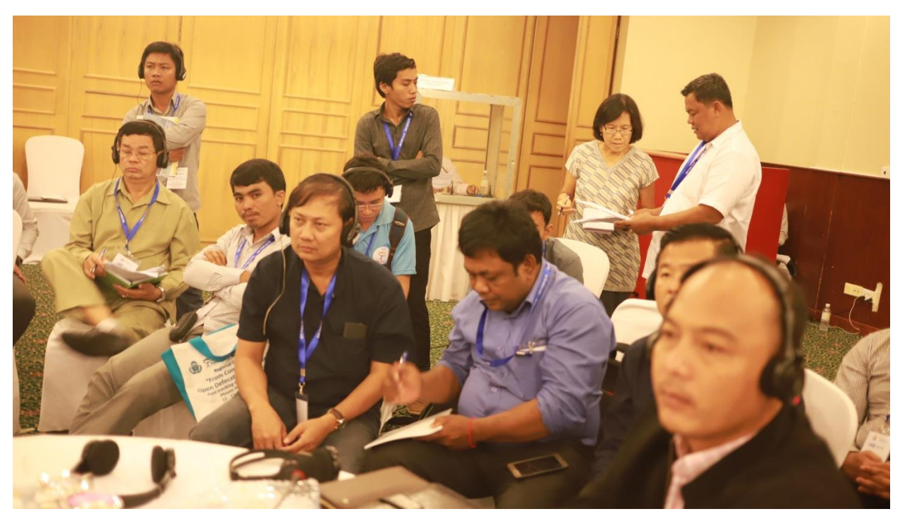
Figure 14 Participants during one of the sessions

o Some programmes also include income generation activities for women (soap production) and promote women engagement in leadership roles