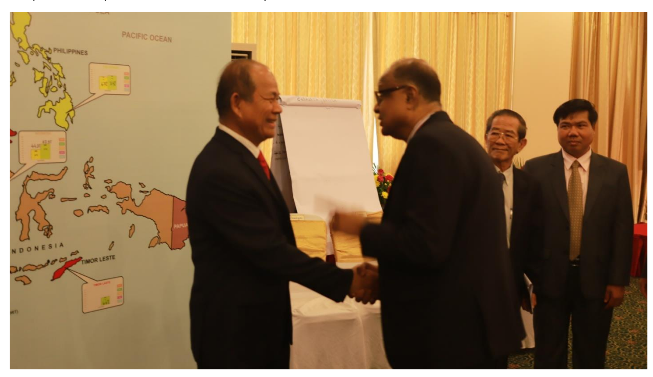
Figure 17 Dr Kamal Kar and Dr Ouk Rabun, Minister of Rural Development, Cambodia