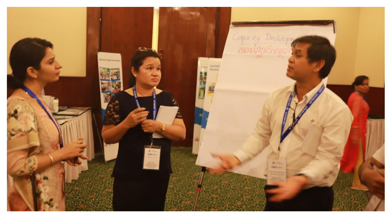
Figure 7 Participants during one of the sessions

Integrating CLTS and the Water Safety Planning interventions as both involve the same committee at the community level ie the Village WASH Coordinating Committee