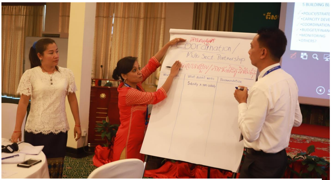
Figure 11: Hybunna Hang, Plan International, Cambodia